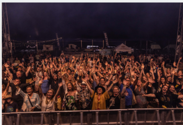
The Airlie Beach Festival of Music crowds LOVE Passport To Airlie bands and they go on to be big and vocal supporters of all the artists. .