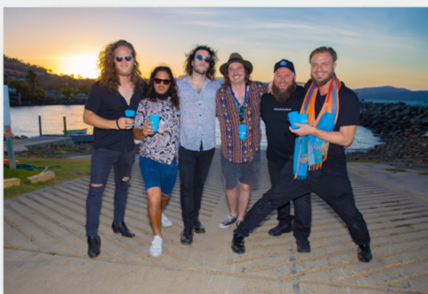
Bands get to meet and network with contemporaries from across Australia