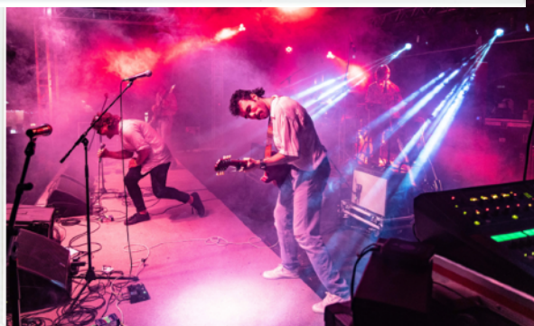
Perry Street Park onstage 2022 going to be the 2022 Passport To Airlie winners.

Want to know something else? Forward your queries to info@airliebeachfestivalofmusic.com.au